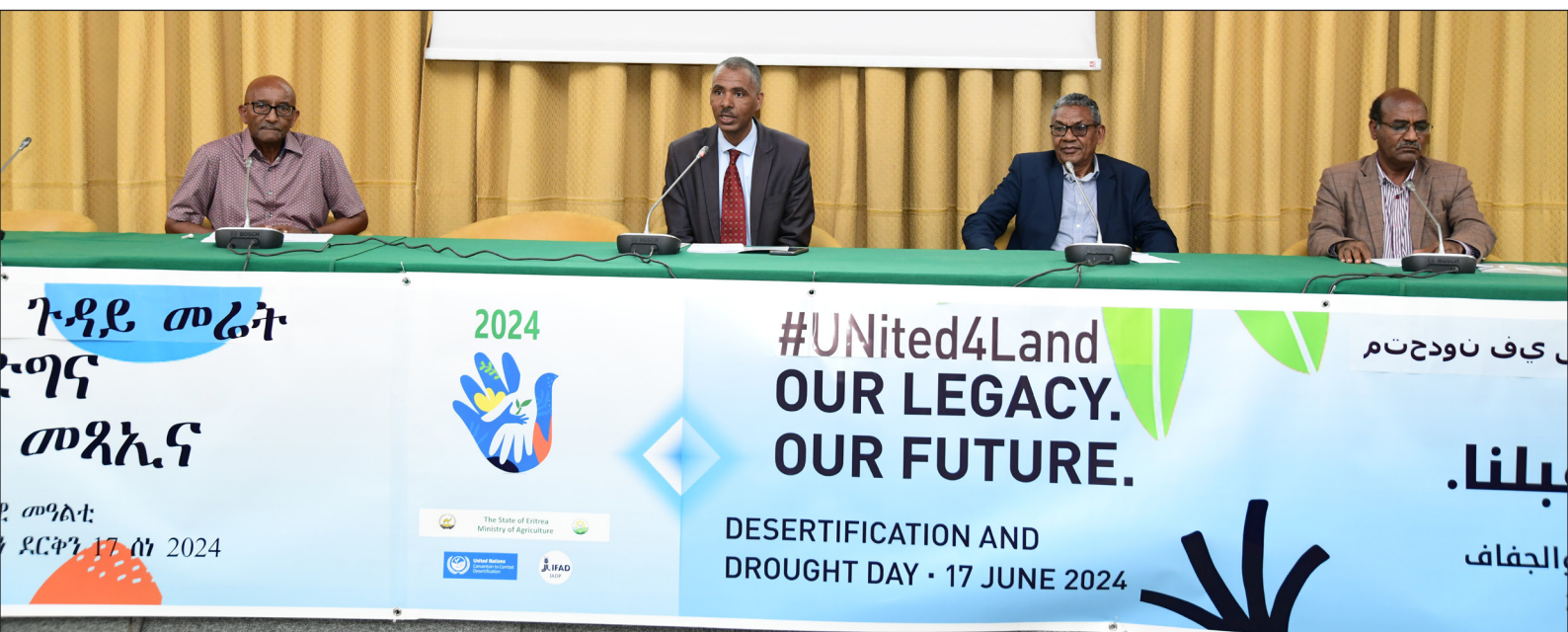
Panelists in Discussion