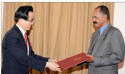
President Isaias with Ambassador Yang Zigang of the People's Republic of China

President Isaias Afwerki, on 18 April, received the credentials of eleven Ambassadors.